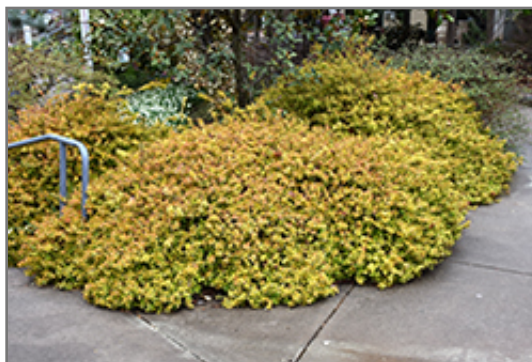
Kaleidoscope Abelia

Kaleidoscope Abelia will grow to be about 30 inches tall at maturity, with a spread of 4 feet. It tends to fill out right to the ground and therefore doesn't necessarily require facer plants in front. It grows at a slow rate, and under ideal conditions can be expected to live for approximately 30 years.