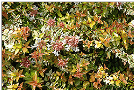
Kaleidoscope Abelia flowers

This shrub will require occasional maintenance and upkeep, and should only be pruned after flowering to avoid removing any of the current season's flowers. It is a good choice for attracting birds, bees and butterflies to your yard, but is not particularly attractive to deer who tend to leave it alone in favor of tastier treats. It has no significant negative characteristics.