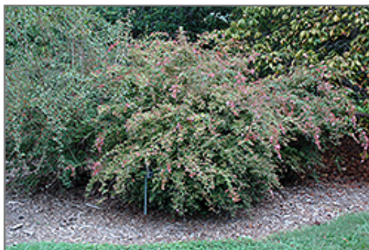
Edward Goucher Abelia in bloom