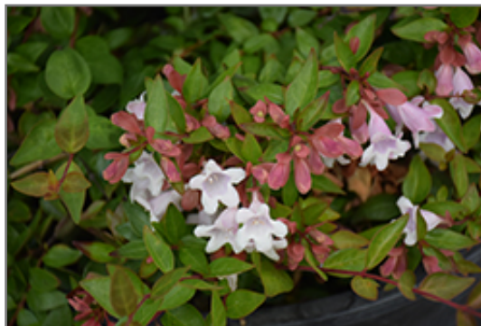
Edward Goucher Abelia flowers

This shrub will require occasional maintenance and upkeep, and should only be pruned after flowering to avoid removing any of the current season's flowers. It is a good choice for attracting birds, bees and butterflies to your yard, but is not particularly attractive to deer who tend to leave it alone in favor of tastier treats. It has no significant negative characteristics.