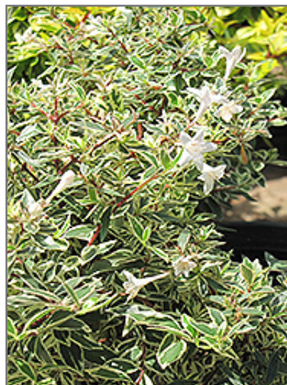
Confetti Abelia in bloom

Confetti Abelia is recommended for the following landscape applications;