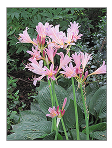
Surprise Lily in bloom