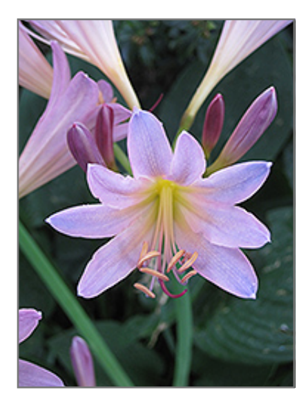
Surprise Lily flowers

Surprise Lily is recommended for the following landscape applications;