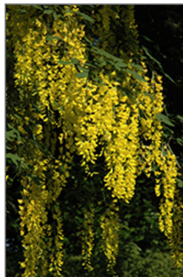
Weeping Laburnum flowers

This is a relatively low maintenance tree, and should only be pruned after flowering to avoid removing any of the current season's flowers. It is a good choice for attracting hummingbirds to your yard. Gardeners should be aware of the following characteristic(s) that may warrant special consideration;