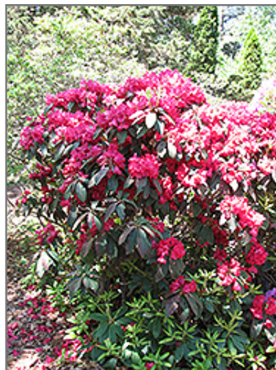
Trilby Rhododendron in bloom