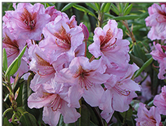
Kabarett Rhododendron flowers

Kabarett Rhododendron is recommended for the following landscape applications;