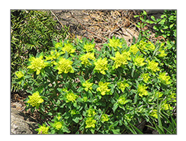
Cushion Spurge in bloom