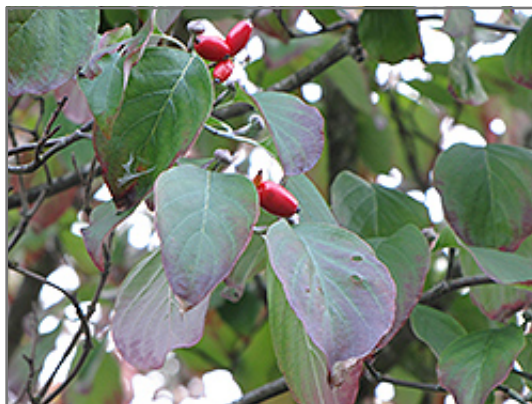
Cherokee Chief Flowering Dogwood fruit

This tree does best in full sun to partial shade. You may want to keep it away from hot, dry locations that receive direct afternoon sun or which get reflected sunlight, such as against the south side of a white wall. It requires an evenly moist well-drained soil for optimal growth, but will die in standing water. It is very fussy about its soil conditions and must have rich, acidic soils to ensure success, and is subject to chlorosis (yellowing) of the foliage in alkaline soils. It is quite intolerant of urban pollution, therefore inner city or urban streetside plantings are best avoided, and will benefit from being planted in a relatively sheltered location. Consider applying a thick mulch around the root zone in winter to protect it in exposed locations or colder microclimates. This is a selection of a native North American species.