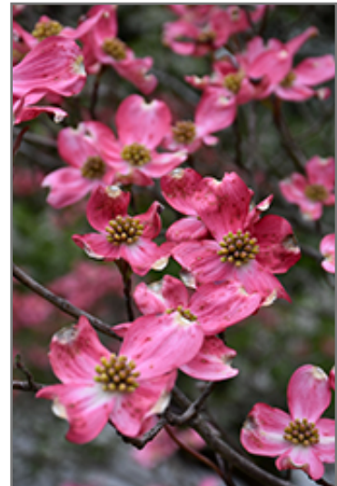
Cherokee Chief Flowering Dogwood flowers

This is a relatively low maintenance tree, and usually looks its best without pruning, although it will tolerate pruning. It is a good choice for attracting birds to your yard. Gardeners should be aware of the following characteristic(s) that may warrant special consideration;