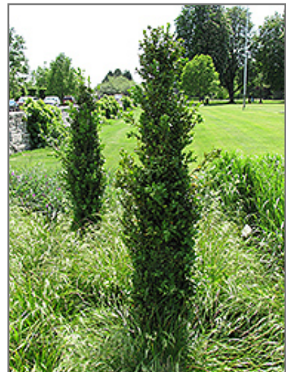
Graham Blandy Boxwood