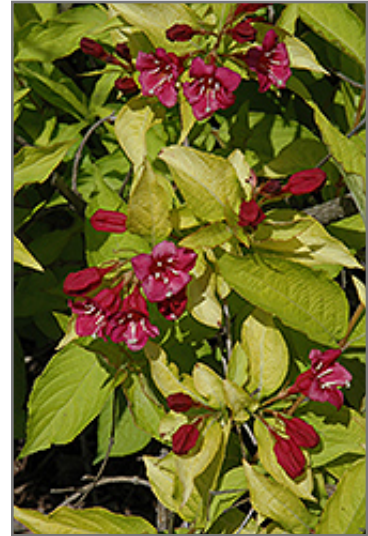
Rubidor Weigela flowers

Rubidor Weigela is recommended for the following landscape applications;