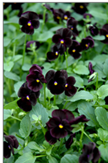
Sorbet Black Delight Pansy flowers

This plant will require occasional maintenance and upkeep, and should only be pruned after flowering to avoid removing any of the current season's flowers. Deer don't particularly care for this plant and will usually leave it alone in favor of tastier treats. Gardeners should be aware of the following characteristic(s) that may warrant special consideration;