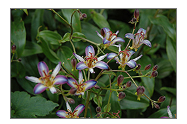
Taipei Silk Toad Lily flowers