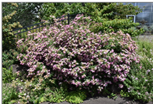
Lemon Princess Spirea in bloom

Lemon Princess Spirea will grow to be about 24 inches tall at maturity, with a spread of 3 feet. It tends to fill out right to the ground and therefore doesn't necessarily require facer plants in front. It grows at a fast rate, and under ideal conditions can be expected to live for approximately 20 years.