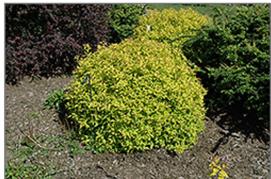
Lemon Princess Spirea