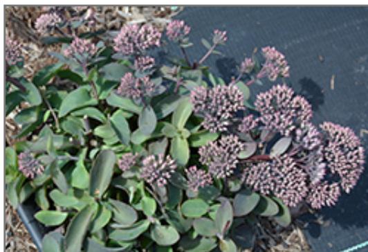
Chocolate Drop Stonecrop flower buds