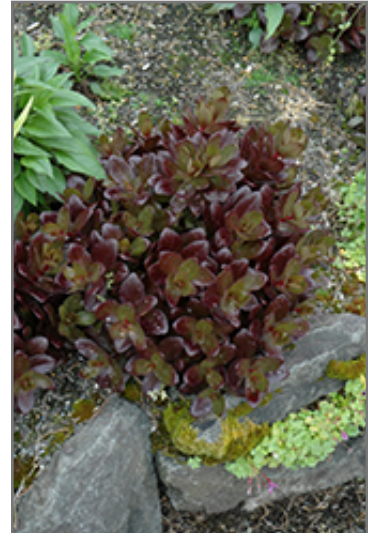
Chocolate Drop Stonecrop

Chocolate Drop Stonecrop is a dense herbaceous perennial with an upright spreading habit of growth. Its relatively coarse texture can be used to stand it apart from other garden plants with finer foliage.