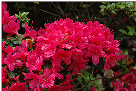
Hino Crimson Azalea flowers

This shrub does best in full sun to partial shade. You may want to keep it away from hot, dry locations that receive direct afternoon sun or which get reflected sunlight, such as against the south side of a white wall. It requires an evenly moist well-drained soil for optimal growth, but will die in standing water. It is very fussy about its soil conditions and must have rich, acidic soils to ensure success, and is subject to chlorosis (yellowing) of the foliage in alkaline soils. It is somewhat tolerant of urban pollution, and will benefit from being planted in a relatively sheltered location. Consider applying a thick mulch around the root zone in winter to protect it in exposed locations or colder microclimates. This particular variety is an interspecific hybrid.