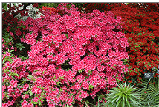
Girard's Rose Azalea in bloom