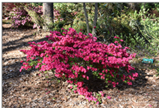
Girard's Fuchsia Evergreen Azalea in bloom