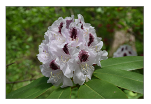
Calsap Rhododendron flowers

This shrub does best in full sun to partial shade. You may want to keep it away from hot, dry locations that receive direct afternoon sun or which get reflected sunlight, such as against the south side of a white wall. It requires an evenly moist well-drained soil for optimal growth, but will die in standing water. It is very fussy about its soil conditions and must have rich, acidic soils to ensure success, and is subject to chlorosis (yellowing) of the foliage in alkaline soils. It is somewhat tolerant of urban pollution, and will benefit from being planted in a relatively sheltered location. Consider applying a thick mulch around the root zone in winter to protect it in exposed locations or colder microclimates. This particular variety is an interspecific hybrid.