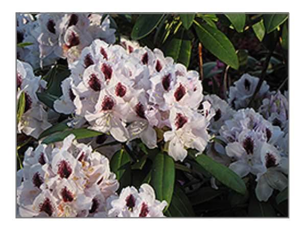
Calsap Rhododendron flowers