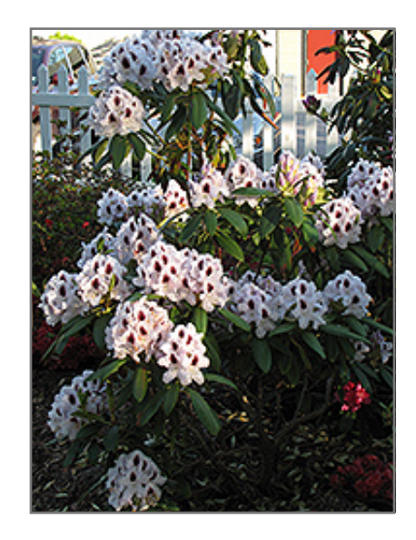
Calsap Rhododendron in bloom