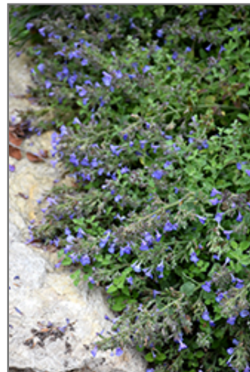
Kit Kat Catmint in bloom