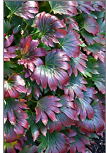
Crimson Fans Mukdenia foliage

This is a relatively low maintenance plant, and is best cleaned up in early spring before it resumes active growth for the season. It has no significant negative characteristics.