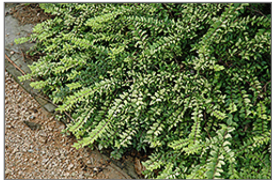
Edmee Gold Honeysuckle