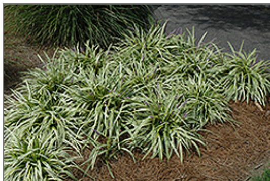
Variegata Lily Turf in bloom