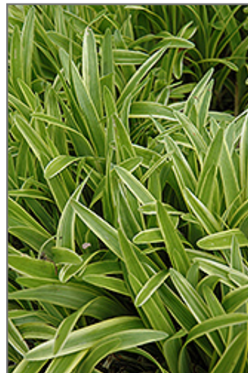
Variegata Lily Turf foliage

This plant does best in partial shade to shade. It does best in average to evenly moist conditions, but will not tolerate standing water. It is not particular as to soil type or pH. It is somewhat tolerant of urban pollution. This is a selected variety of a species not originally from North America. It can be propagated by division; however, as a cultivated variety, be aware that it may be subject to certain restrictions or prohibitions on propagation.