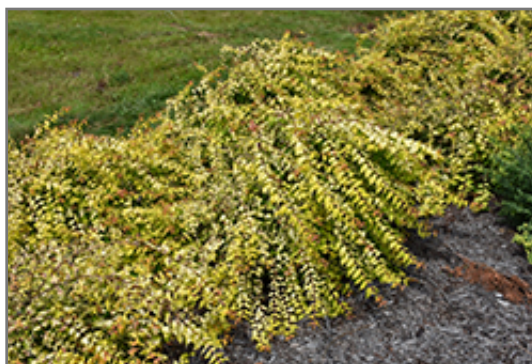
Dream Catcher Beautybush