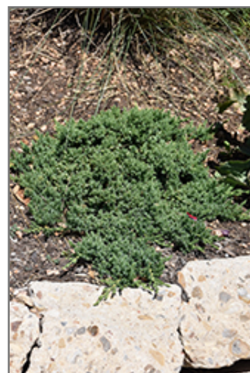
Green Mound Dwarf Japanese Juniper