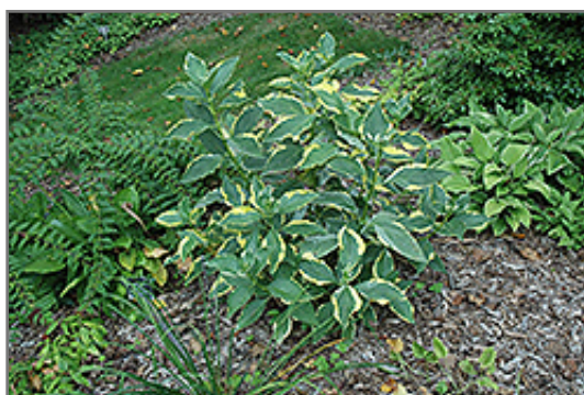
Lemon Wave Hydrangea