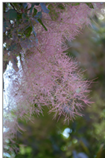
Royal Purple Smokebush flowers

This shrub should only be grown in full sunlight. It is very adaptable to both dry and moist locations, and should do just fine under average home landscape conditions. It is not particular as to soil type or pH. It is highly tolerant of urban pollution and will even thrive in inner city environments, and will benefit from being planted in a relatively sheltered location. This is a selected variety of a species not originally from North America.