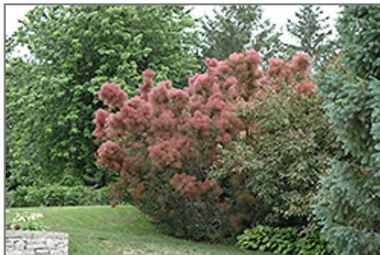
Royal Purple Smokebush in bloom

This shrub will require occasional maintenance and upkeep, and is best pruned in late winter once the threat of extreme cold has passed. Deer don't particularly care for this plant and will usually leave it alone in favor of tastier treats. It has no significant negative characteristics.