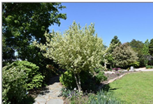
Variegated Cornelian Cherry Dogwood