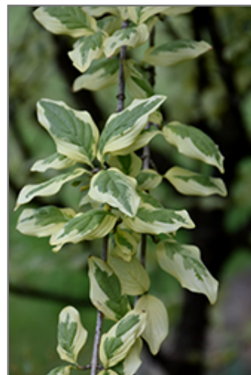
Variegated Cornelian Cherry Dogwood foliage

This is a relatively low maintenance tree, and should only be pruned after flowering to avoid removing any of the current season's flowers. It is a good choice for attracting birds to your yard. It has no significant negative characteristics.