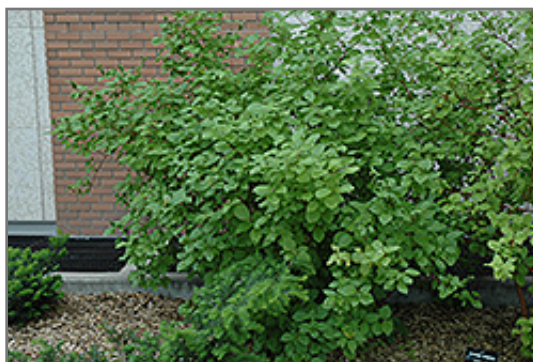
Siberian Dogwood