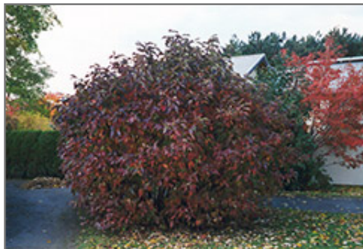
Siberian Dogwood in fall

This shrub does best in full sun to partial shade. It is an amazingly adaptable plant, tolerating both dry conditions and even some standing water. It is not particular as to soil type or pH. It is highly tolerant of urban pollution and will even thrive in inner city environments. This is a selected variety of a species not originally from North America.