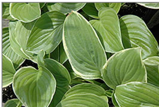
Frozen Margarita Hosta foliage