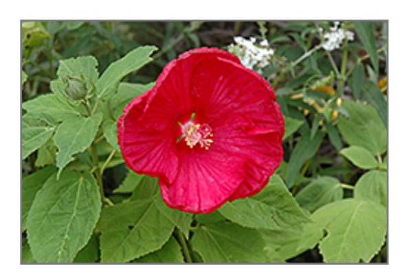
Disco Belle Rosy Red Hibiscus flowers

Disco Belle Rosy Red Hibiscus is recommended for the following landscape applications;