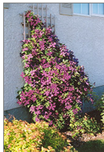
Polish Spirit Clematis in bloom