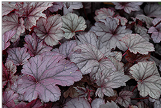
Shanghai Coral Bells foliage

Shanghai Coral Bells is recommended for the following landscape applications;