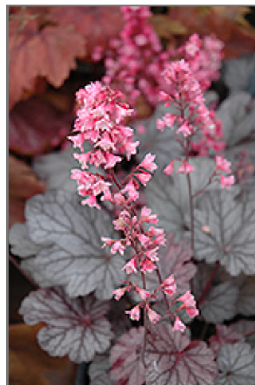
Milan Coral Bells flowers

Milan Coral Bells is recommended for the following landscape applications;