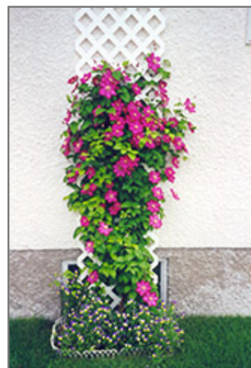
Ville de Lyon Clematis in bloom