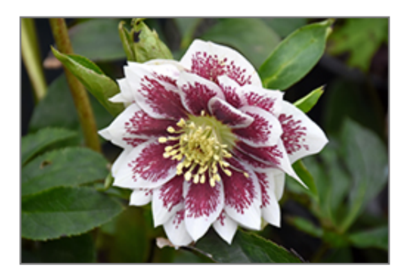
Painted Doubles Hellebore flowers

Painted Doubles Hellebore is recommended for the following landscape applications;