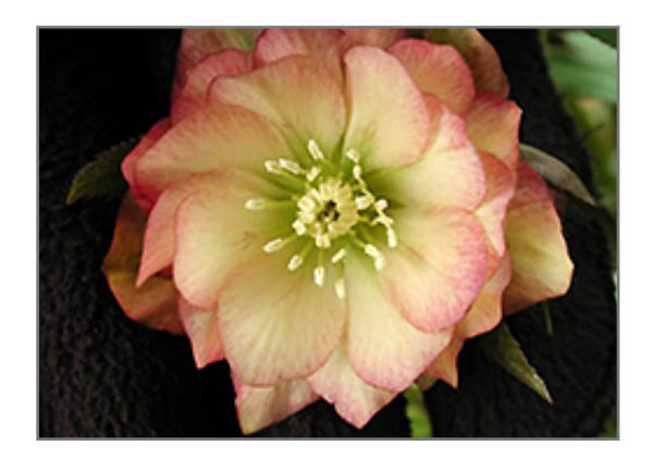
Amber Gem Hellebore flowers