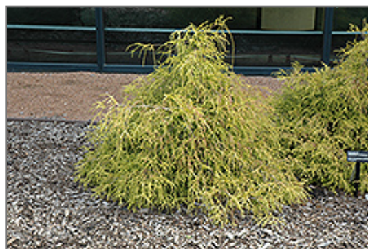
Sungold Falsecypress