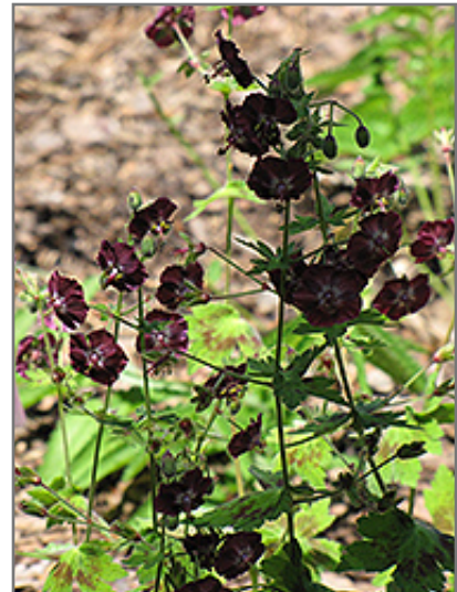
Samobor Cranesbill in bloom

Samobor Cranesbill is recommended for the following landscape applications;