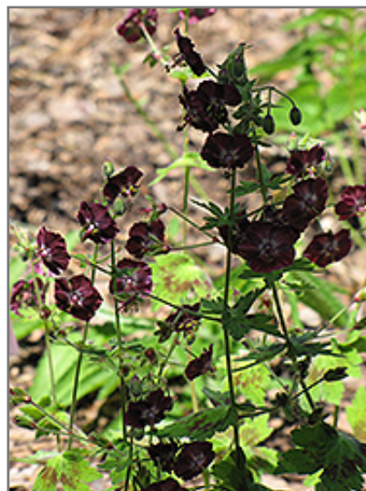
Samobor Cranesbill in bloom

Samobor Cranesbill is recommended for the following landscape applications;