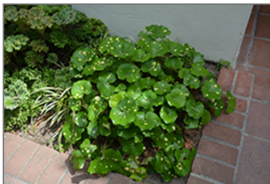
Variegated Leopard Plant