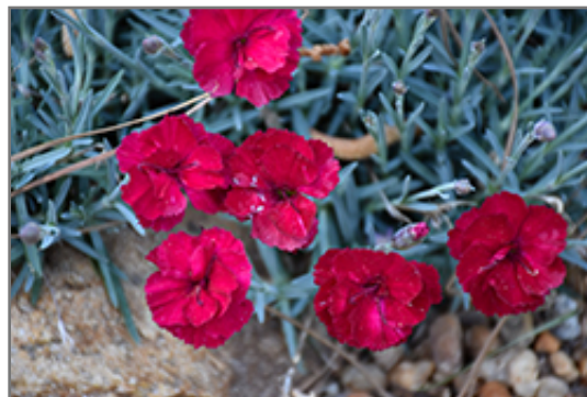
Frosty Fire Pinks flowers