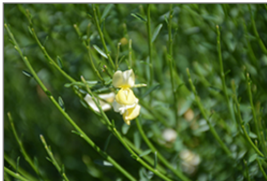
Moonlight Scotch Broom flowers

This shrub should only be grown in full sunlight. It prefers dry to average moisture levels with very well-drained soil, and will often die in standing water. It is considered to be drought-tolerant, and thus makes an ideal choice for xeriscaping or the moisture-conserving landscape. It is particular about its soil conditions, with a strong preference for clay, alkaline soils, and is able to handle environmental salt. It is highly tolerant of urban pollution and will even thrive in inner city environments. This is a selected variety of a species not originally from North America.