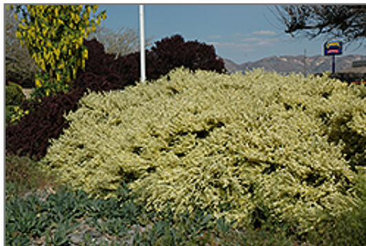
Moonlight Scotch Broom in bloom