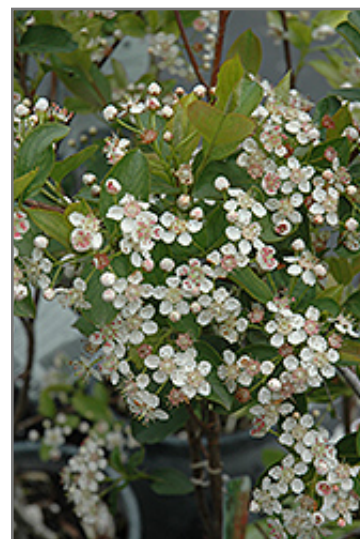
Viking Chokeberry flowers