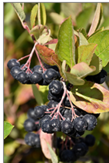
Viking Chokeberry fruit

This shrub should only be grown in full sunlight. It is an amazingly adaptable plant, tolerating both dry conditions and even some standing water. It is not particular as to soil type or pH, and is able to handle environmental salt. It is somewhat tolerant of urban pollution. This particular variety is an interspecific hybrid.