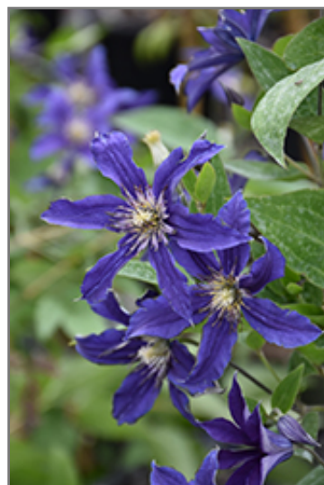
Sapphire Indigo Clematis flowers