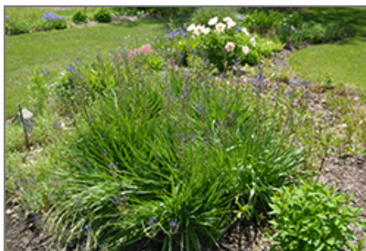
Blue Danube Camassia in bloom