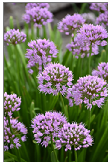
Summer Beauty Ornamental Chives flowers