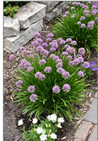
Summer Beauty Ornamental Chives in bloom

Summer Beauty Ornamental Chives is recommended for the following landscape applications;