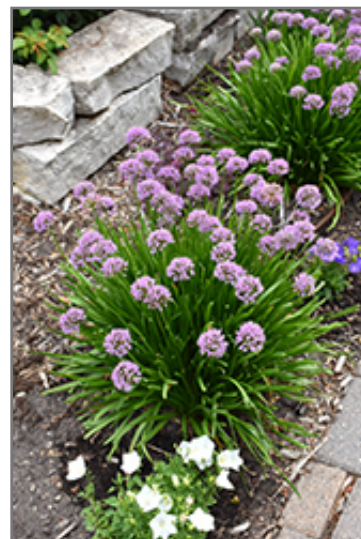
Summer Beauty Ornamental Chives in bloom

Summer Beauty Ornamental Chives is recommended for the following landscape applications;