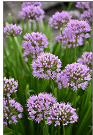
Summer Beauty Ornamental Chives flowers