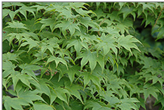
Utsu Semi Japanese Maple foliage

Utsu Semi Japanese Maple is recommended for the following landscape applications;