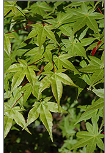
Shindeshojo Japanese Maple foliage

Shindeshojo Japanese Maple is recommended for the following landscape applications;