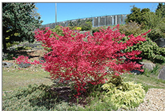
Shindeshojo Japanese Maple in spring

This tree does best in full sun to partial shade. You may want to keep it away from hot, dry locations that receive direct afternoon sun or which get reflected sunlight, such as against the south side of a white wall. It prefers to grow in average to moist conditions, and shouldn't be allowed to dry out. It is not particular as to soil pH, but grows best in rich soils. It is somewhat tolerant of urban pollution, and will benefit from being planted in a relatively sheltered location. Consider applying a thick mulch around the root zone in winter to protect it in exposed locations or colder microclimates. This is a selected variety of a species not originally from North America.