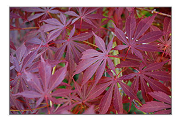
Sherwood Flame Japanese Maple foliage

This is a relatively low maintenance tree, and should only be pruned in summer after the leaves have fully developed, as it may 'bleed' sap if pruned in late winter or early spring. It has no significant negative characteristics.