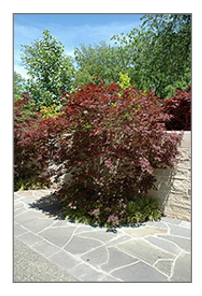
Sherwood Flame Japanese Maple

Sherwood Flame Japanese Maple is recommended for the following landscape applications;