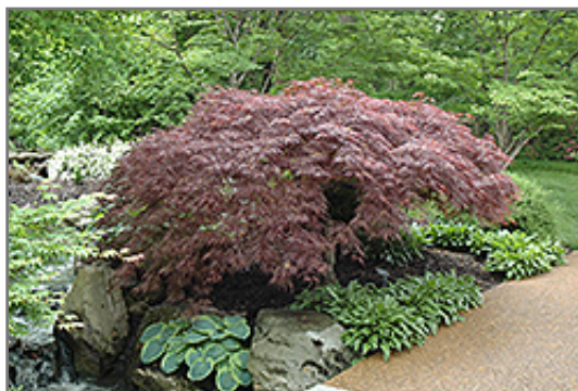
Red Select Japanese Maple Photo courtesy of NetPS Plant Finder