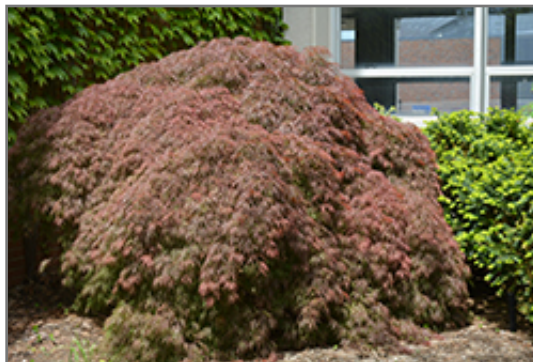
Red Select Japanese Maple

Red Select Japanese Maple will grow to be about 20 feet tall at maturity, with a spread of 20 feet. It has a low canopy with a typical clearance of 2 feet from the ground, and is suitable for planting under power lines. It grows at a slow rate, and under ideal conditions can be expected to live for 60 years or more.